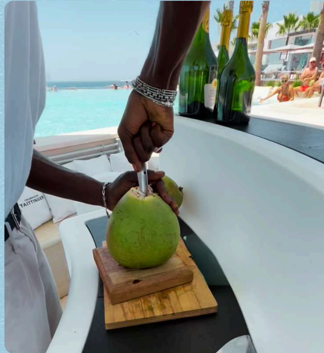
EASY TO OPEN