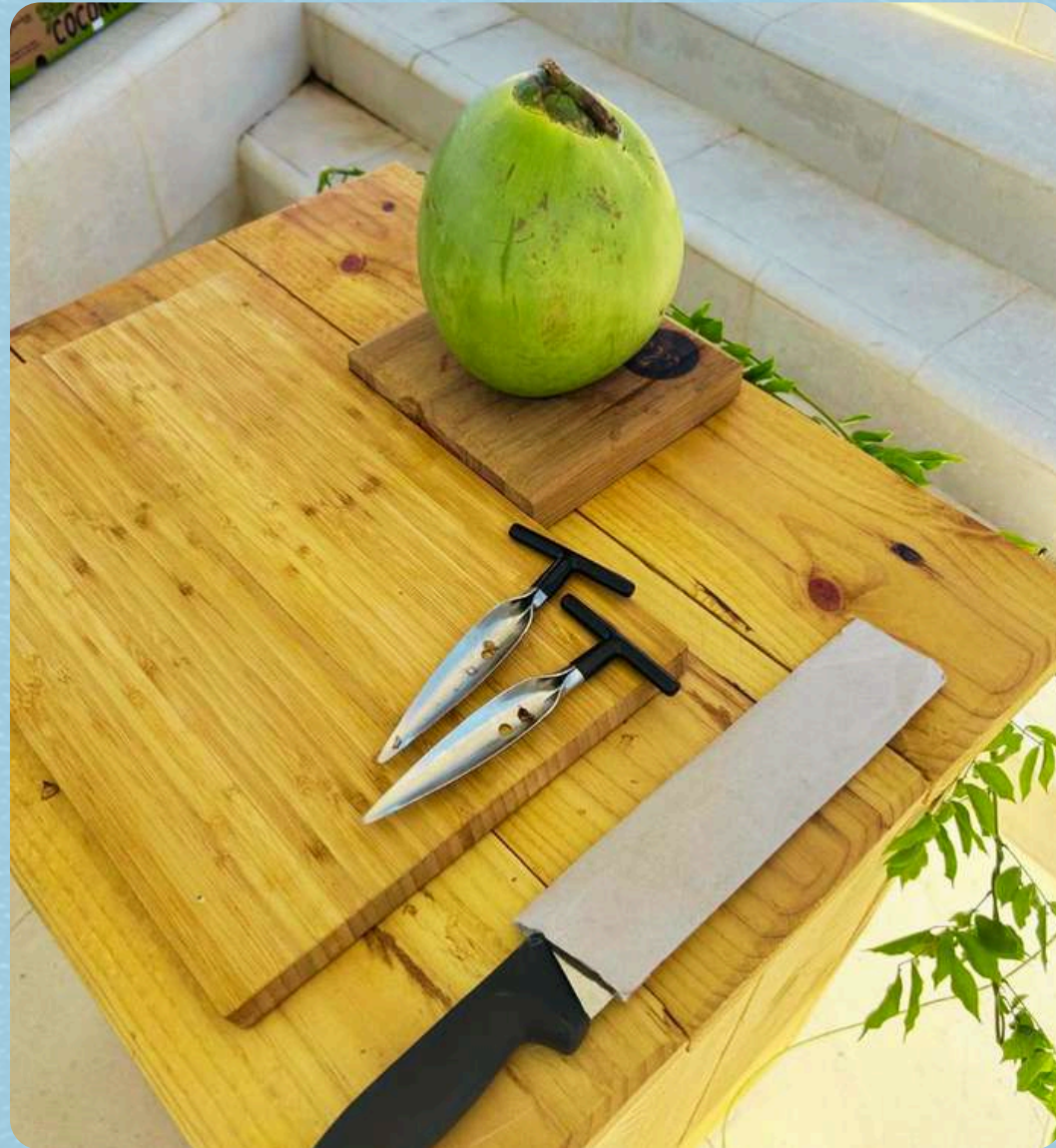
EASY TO PREPARE